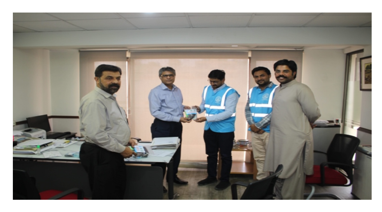
<u>Community Emergency Response Teams (CERT) of PDMA Sindh engaged in COVID-19 awareness</u>

The Representative of Muslim Hands providing 1000 preventive kits to PDMA Sindh.